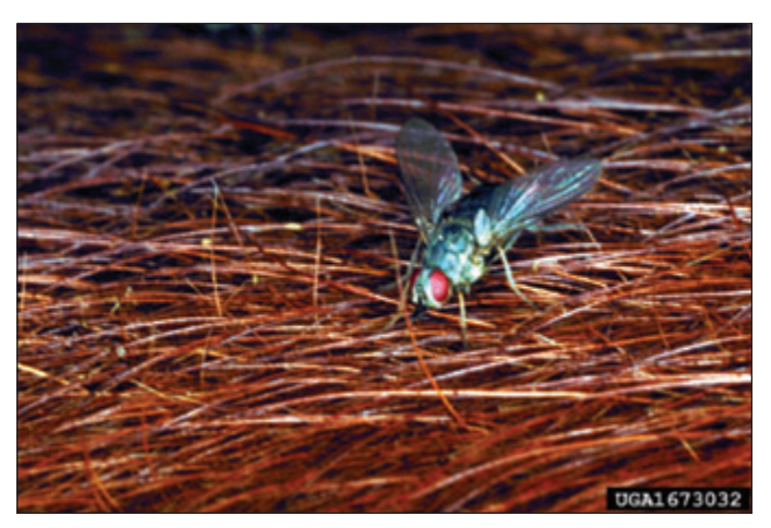
Figure 5. A horn fly feeding on a cow.

They are similar in color to a stable fly but half the size. Horn flies have spear-like piercing mouthparts protruding from under their heads which allow them to feed on blood. Horn flies spend all their time on the animal except when a female leaves to deposit eggs in fresh cattle feces less than 10 minutes old. Females usually lay no more than 20 eggs per batch, which are deposited in groups of three to seven. During her lifetime, a female can lay 200 to 500 eggs.