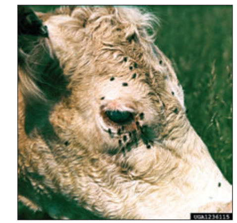
Figure 8. Face flies feeding on cattle.

Female face flies are primarily found clustering around the eyes and nose of cattle, whereas the males feed only on nectar and dung. They breed in fresh cattle feces with a life cycle similar to horn flies. The cycle from egg to adult is completed within 11 to 17 days, and they overwinter as adults in protected areas, such as farmhouses, barns, church steeples, etc.