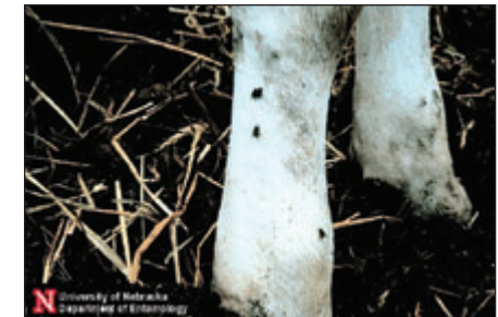
Figure 11. Stable flies feeding on the legs of cattle. (Jack Campbell, UNL Entomology)

Augmenting with commercial parasitoids in organic dairy production can keep stable fly populations at a level where little or no chemical control is needed, just as with house flies. The same procedures listed