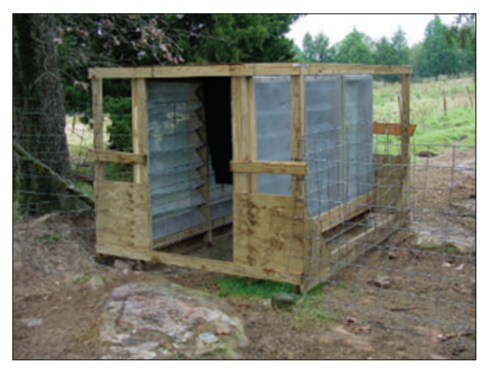
Figure 6. A walk-through (Bruce) horn fly trap.

The life cycle of the horn fly consists of the same life stages as the house fly. It takes horn flies 9 to 12 days to complete the cycle from egg to adult. The adults live from 6 to 8 weeks, and mating occurs on the host about 3 days after emergence. There are two seasonal horn fly peaks during spring and fall, and they overwinter in the soil as pupae. Large populations can result in a decrease in body weight and feed efficiency related to blood loss and annoyance to the animal. Large horn fly numbers can also cause a 10 to 20 percent decrease in milk production.