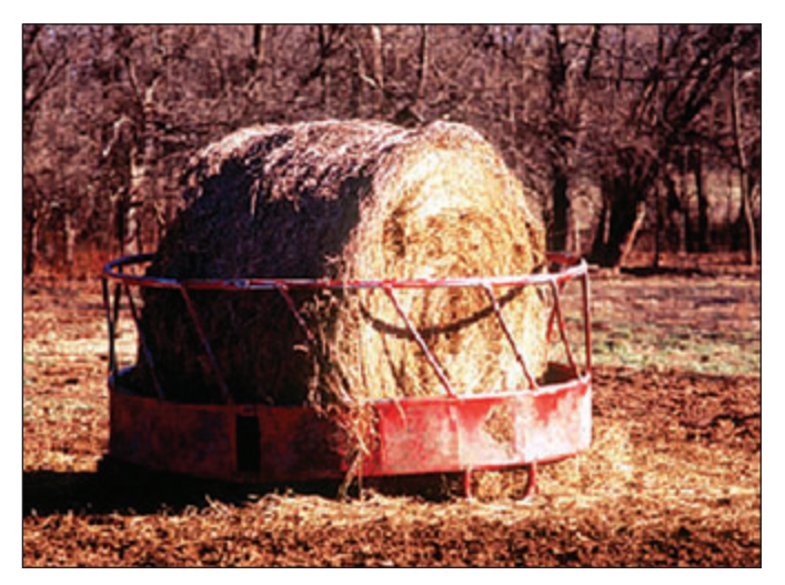
Figure 10. Potential stable fly breeding site.

parts similar to horn flies; their piercing mouthparts protrude from under their heads and allow them to take blood meals. Both male and female stable flies feed on blood.