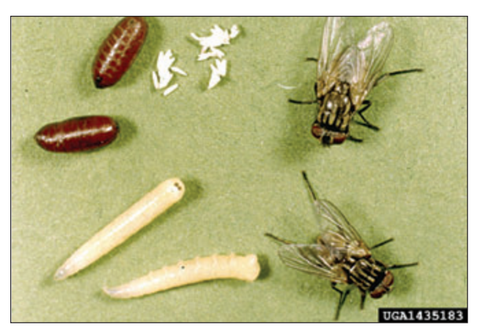
Figure 1. The life cycle of the house fly.

Large numbers of house flies can become a serious nuisance around the dairy and to nearby neighbors and potentially pose public health threats